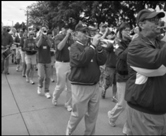
Marching to Memorial Stadium for the game.

Please don't miss your chance to participate by missing the August 22, 2009, deadline!